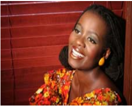
Somi Image Award