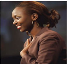
Immaculee Ilibagiza Community Hero

Musician, artist. A true multicultural woman, Somi was born in Illinois to immigrants from Rwanda and Uganda, then spent her early childhood in Zambia. The African cultural legacy, always crucial to her sound, is as vital as ever in her current music, which Somi likes to call New African Soul. But so too is the music she heard upon relocating to New York, with American jazz singers like Nina Simone and Sarah Vaughan as essential to her artistic development as the legendary African female voices of Miriam Makeba, Cesaria Evora and Sade.