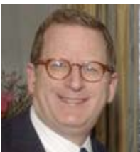
Bruce Charash Friend of Africa

Rwanda genocide survivor, philanthropist, UN goodwill ambassador, author -- Immaculée's life was transformed dramatically during the 1994 Rwandan genocide where she and seven other women spent 91 days huddled silently together in the cramped bathroom of a local pastor's house. For more details, please visit our website at http://www.afrimetro.org/web/holidayGala-awards.php .